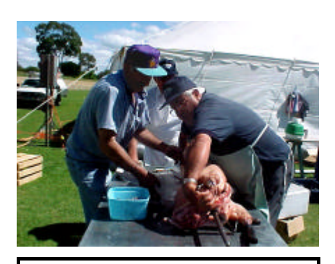
Above: Peloponnesian struggle, its hard work getting those lambs onto the spit.