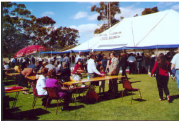
The PFSA tent at the festival surrounded by friends and guests both outside (above) and inside (below).

The achievement of such a sense of unity could not have come at a more appropriate time than during an Olympic year, and in particular being the Australian Olympics. For it was the Olympic spirit during the time of ancient Greece which brought the various Greek states together as Hellenes to participate peacefully as one nation in the various events at ancient Olympia.