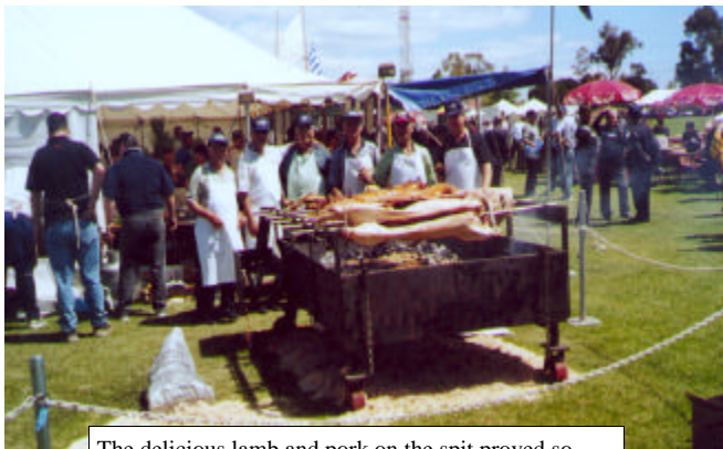
The delicious lamb and pork on the spit proved so popular that not even a scrap of meat was left over after the festival. Thanks to the excellent cooks shown here.