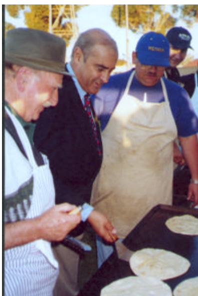
On this occasion the Premier is showing a few pita bread cooking tips of his own – nothing like a multi-skilled politician.