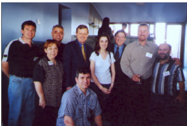
Members of the PFSA board with the leader of the opposition, The Hon Mike Rann (4th from left) and Steve Georganas ALP member for Hindmarsh (3rd from right).