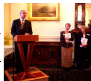
Above: Premier Mr John Olsen addressing the invited guests in parliament at the official launch

House on Friday 27 October organised by the Patron of the festival The Hon John Olsen, Premier of South Australia. It is therefore with great appreciation that the PFSA thanks the Premier for his support of the festival and continued support of such events which reinforce the multicultural fabric of South Australia.