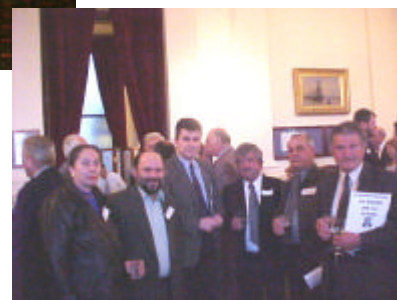
Below: Members of the PFSA soaking in the atmosphere at the launch