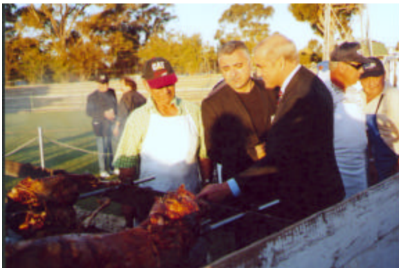
The Premier Mr Olsen being shown the finer points of cooking on the spit.