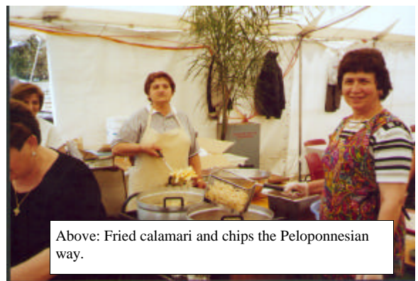
Above: Fried calamari and chips the Peloponnesian way.