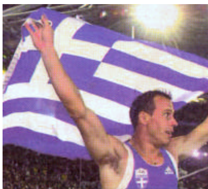
Costas Kenteris with the Greek flag celebrating victory in the 200 meters

The significance of these games lay not in the medals and victories alone, but also in the atmosphere brought about by the presence of a multitude of nations from all over the globe competing in peace and harmony. It was this atmosphere which motivated the Australian public to acknowledge and embrace the Olympic spirit like no other time before. This very same spirit is what interrupted and transformed the bloody and barbaric quests for power and control on the battle fields be-